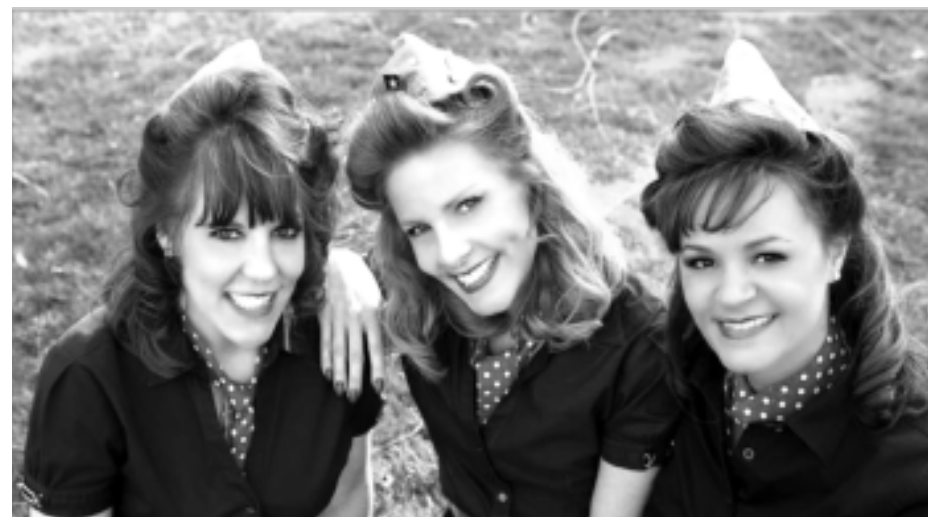
The Legacy Girls – The Sounds and Style of the Andrews Sisters.