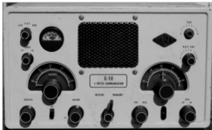
Gonsett Model G-50.

The Communicator was later repackaged as a model IV in a low profile black cabinet with the various chassis modules side by side, and a 220-225 MHz version was added to the product line. But what prompted me to write this article was my recent hamfest find, a Gonset G-50. This radio had some similarities to the Communicator III, but the G-50 and its ten meter cousin, the G-28, were much more powerful, having a 6146 final tube modulated by a pair of 6L6GC's, built in transmitter VFO in addition to crystal control, and an AC only power supply all on one unified chassis. Both the G-28 and G-50, which were intended as base stations with 110 VAC power only, were also available as CD models with yellow cabinets and wider IF bandpass as well.