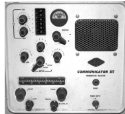
Gonsett Communicator III.

Donley’s Wild West Town is located 45 minutes Northwest of O’Hare airport just off Interstate 90, at the intersection of Route 20 & S. Union Road, 2 miles south of the village of Union, in McHenry County Illinois. GPS 8512 S. Union Rd. Union, IL 60180. For further information call 815.923.9000 or see www.WildWestTown.com .