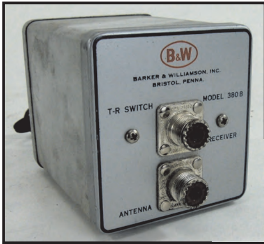
B&W 380B TR Switch.

B&W is still in business today – the founders sold the company in 1964 and moved operations to Florida, where they continue to produce a wide variety of RF coil products for industry.