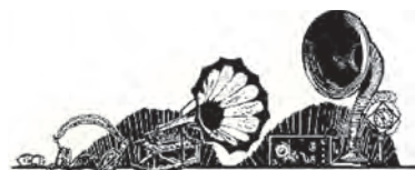
VINTAGE RADIO & PHONOGRAPH SOCIETY, INC.