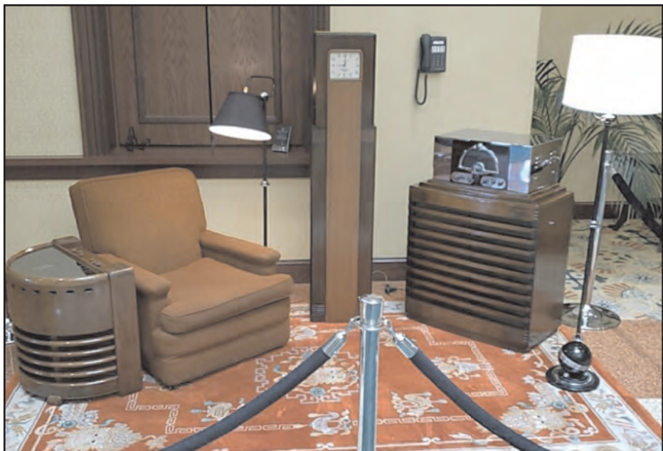
ART DECO LOBBY DISPLAY. Radios left to right: 1937 Stromberg Carlson Model 231 Arm Chair, AM & SW, 7 tubes. 1932 Westinghouse model WR 8 Columaire, AM, 9 tubes. 1937 McMurdo Silver Masterpiece VI with Clifton cabinet, AM, 4 SW, 21 tubes.