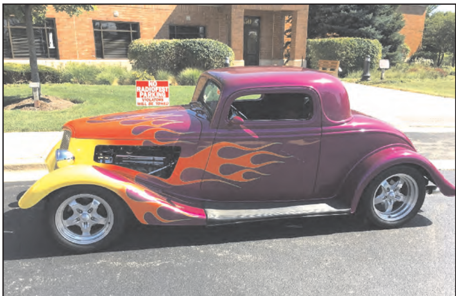
An unknown parking scofflaw.