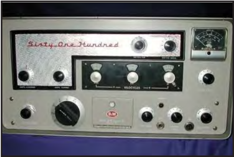
B&W 6100 SSB Transmitter.