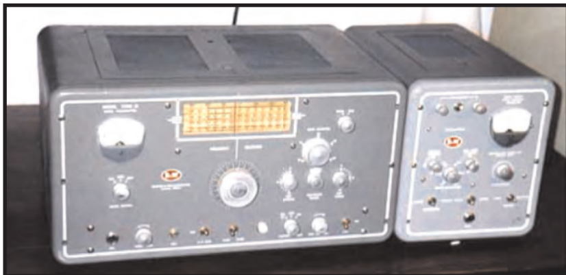
B&W 5100B and 51SB.

Although B&W was a major supplier of high quality inductors for many other manufacturers of electronic equipment, they also produced a highly regarded line of amateur radio gear in the 1950s and early 1960s. For example, they offered the model 5100 transmitter, an AM/CW "boat anchor" using a pair of 6146 tubes in the final RF output stage, modulated by another pair of 6146s. Early 5100s covered 80 through 10 Meter ham frequencies including the 11 Meter band. This band was later deleted when the 5100B model was introduced, since the FCC had reallocated 11 Meters to Citizens' Band use. Single Sideband – SSB – was beginning to replace AM for phone operation.