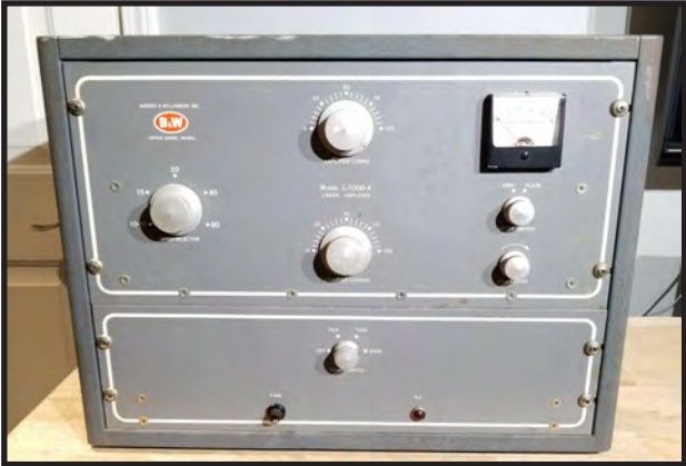
B&W L1000A Linear Amplifier.

B&W also produced several accessories for the ham market, including the 380B and 381 electronic T-R switch, which replaced a coax relay that changed the antenna feedline from transmitter to receiver. One of their last ham products was the VS-300A antenna tuner, which covered 160 through 10 Meters rated at a capacity of 300 Watts of RF.