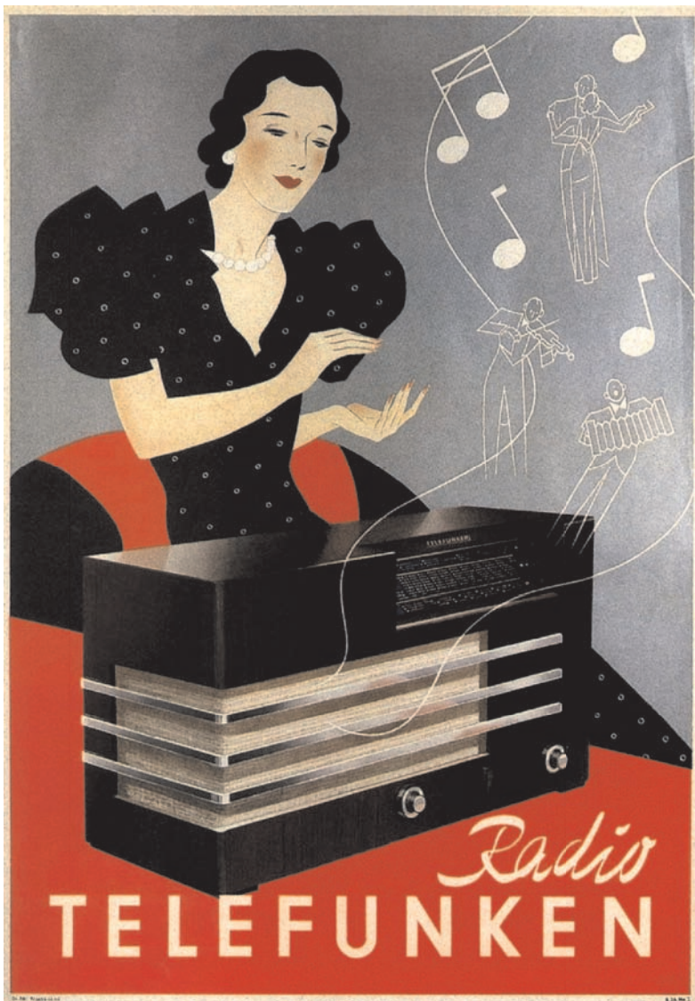
RADIOFEST 2019 THEME “Art Deco and Machine Age Electronics” (Telefunken 1935 Poster)