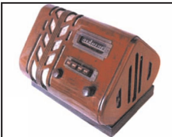
The 1938 Stewart-Warner 91-413 “Spade” radio cabinet is of walnut veneer. The set has six tubes and four pre-set tuning buttons. It was listed at $4195 by The New York Times Store.

This inspired me to do a bit of research on art deco radios in general. The term art deco describes a design technique that reflects bold industrial-age imagery, including geometric shapes and machine parts. The term may have originated with architect Le Corbusier, when in 1925 he entitled a series of articles “1925 Expo Arts Deco,” in reference to the International Exposition of Modern Decorative and Industrial Arts. Lore has it that art deco radios did not become widely popular until the catalin and other plastic processes were developed. This is not strictly true, as many fine art deco cabinets were made of wood. In fact, every major maker offered wood art deco designs. Several outstanding designs were offered by Emerson. Others include the Wurlitzer “Lyric,” the Automatic “Tom Thumb,” the Halson “Jefferson” (blonde wood with black lacquer accents), and the Silvertone “Mission Bell” (wood with black lacquer detail). The 1936 Arvin “Rhythm King” is housed in a deco design 43-inch-tall contrasting walnut-veneer cabinet. The four-band set has 11 tubes, a woofer and a tweeter, and a magic-eye tube. A tabletop version, the “Rhythm Queen,” in 2014 was listed by The New York Times Store for $2625.