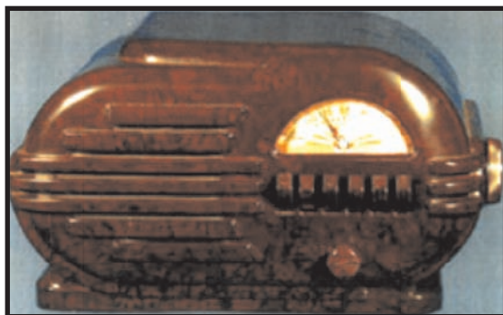
The Belmont 6D-111 is a bakelite set from 1938 that is highly valued. Its tube complement: 35Z5, 35L6, 12SQ7, 12SA7, and 12SD6.

Fillers of carbon, cotton and cloth were added to strengthen the bakelite, and this could add some character (e.g., mottling and swirls) to an otherwise black or dark brown cabinet.