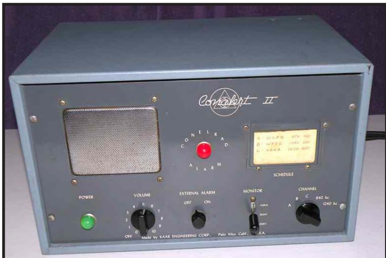
KAAR Conalert II monitor receiver.