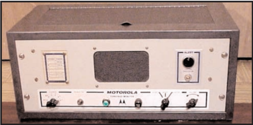
Motorola CONELRAD receiver.

When CONELRAD was active, manufacturers of AM broadcast receivers were required to identify the 640 and 1240 kHz frequencies on the radios' dials with little triangles, so this is an easy way to spot a radio that would have been manufactured between 1957 and 1963!