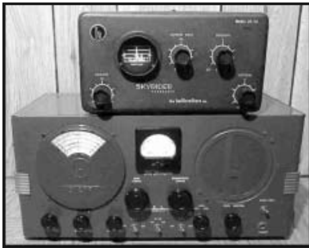
Hallicrafters SP-44 with S-20R.

Panadapters were initially developed for our military and used during World War II, especially by the Navy. They were first introduced to hams shortly after the war by Hallicrafters, who marketed their SP-44. This was really a relabeled unit made by the Panoramic Radio Corp. of New York City that was also sold by PRC as their Model PCA-2. This little box is best described as a sort of receiving converter with video output displayed on a small CRT screen. It had a continuously variable oscillator that electronically tuned back and forth (“scanning”) over a small range of the spectrum, plus or minus a couple hundred of kc from the center frequency. Signals show up on the screen as “pips” of varying height, according to their signal strength.