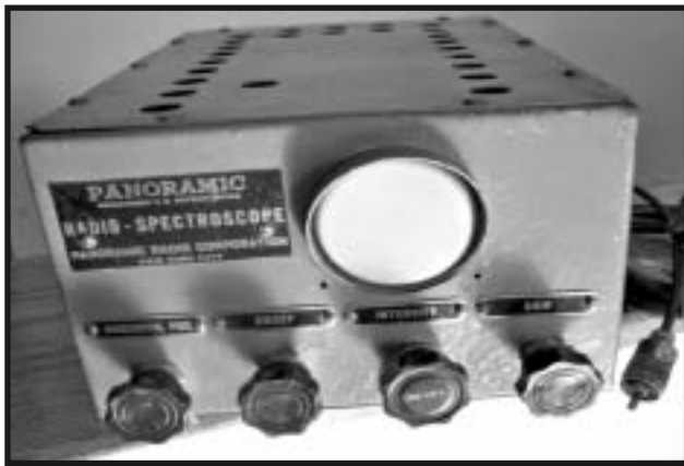
PRC Navy RBW-2M.