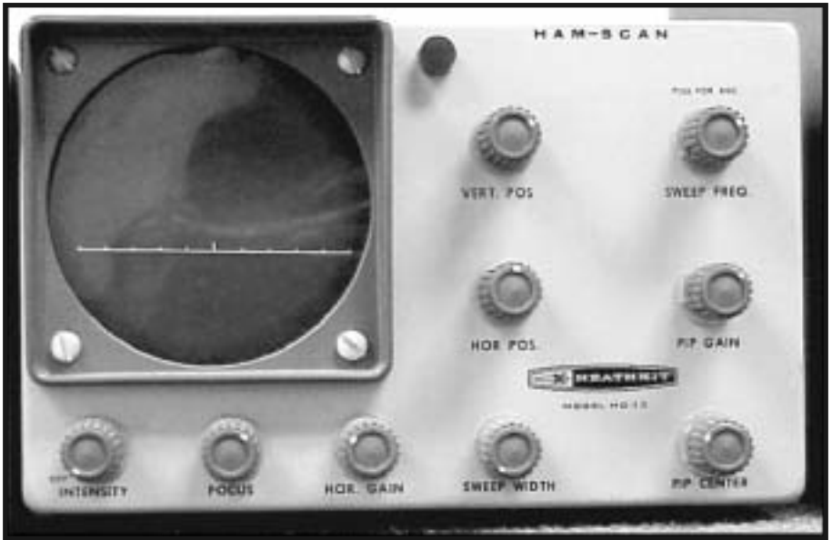
Heath HO-13 Panadapter.