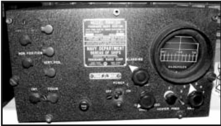
PRC Navy RBW-2M.