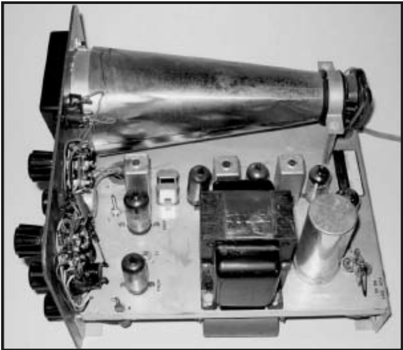
Heathkit SB-620 chassis.