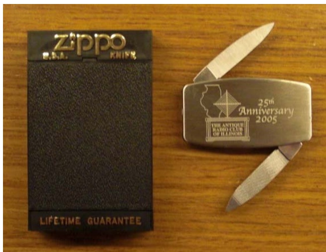
25th Anniversary Zippo money clip that copies the original money clip issued to founding members.