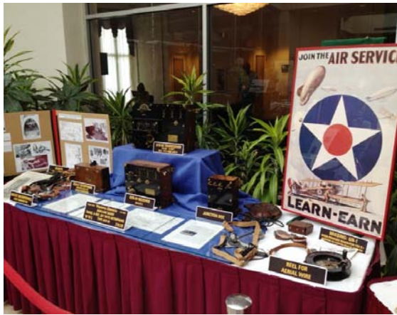
2015 - Zenith