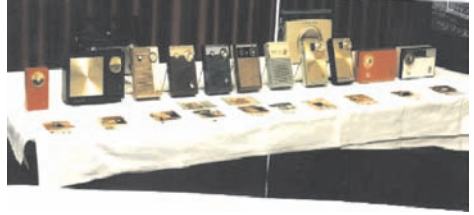
2005 - 25th Anniversary