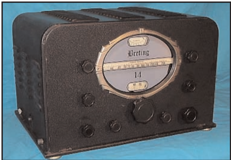
Breting Model 14.

My Breting 9 was originally priced at $54, and the more elaborate models were offered at up to $99. My Breting 9 has a chrome chassis, smooth operating, easy to read tuning dial, and is housed in a sturdy steel case with a black finish. An external speaker or headphones are required.