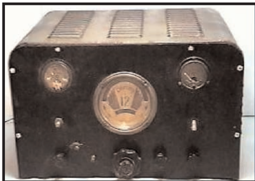
Breting Model 12.

Breting's radios were identified by numbers coinciding with their tube count: 6, 9, 12, 14, and 14AX, and generally covered the 550 kc – 30 Mc range. A Breting Model 12 and Model 14 are shown below