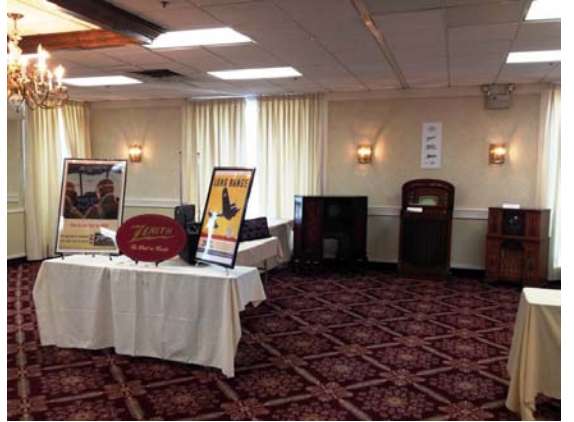
2016 - RCA / Marconi