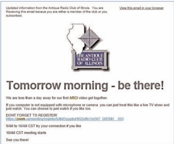
Sample notice for ARCI Zoom Meeting.

In my opinion, this was a successful first effort, and it provided a great forum for ARCI club members to share their knowledge and experience about radios. We were able to meet from a great social distance, including folks in Florida, Texas, Missouri and North Carolina! Many thanks to all who participated!