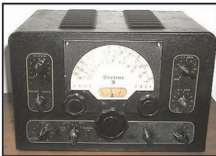
Breting Model 9.

My Breting 9 was originally priced at $54, and the more elaborate models were offered at up to $99. My Breting 9 has a chrome chassis, smooth operating, easy to read tuning dial, and is housed in a sturdy steel case with a black finish. An external speaker or headphones are required.